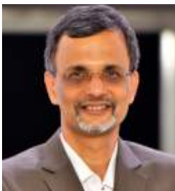
Dr. V. Anantha Nageswaran , Chief Economic Adviser - Government of India.

Dr. V. Anantha Nageswaran is the current Chief Economic Advisor to the Government of India.